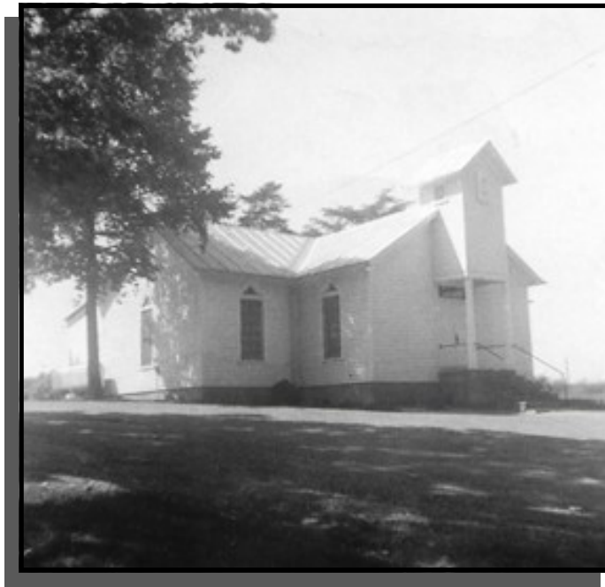
Goodview Baptist Church as it was originally.

1922 —Goodview Baptist Church was dedicated on June 20 th .